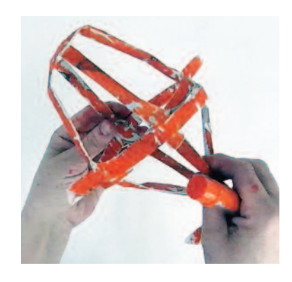
Tape 2 sticks together to make a cross. Gather the ends together and tape. Open out the shape and fix in place with 3rd stick